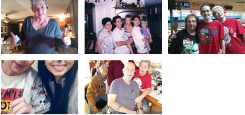
Stewart Family Funeral Home - September 17, 2018 at 09:21 AM

“ 82 files added to the album LifeTributes