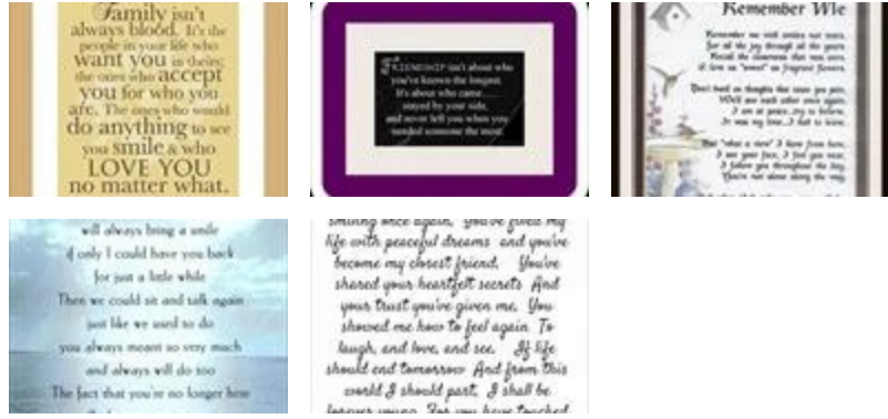
Louise E. Bohler - September 17, 2018 at 11:07 AM